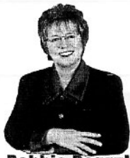
Debbie Dogrul Associates, LLC