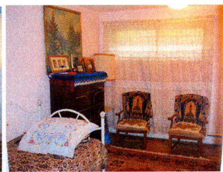
Bed Room #2