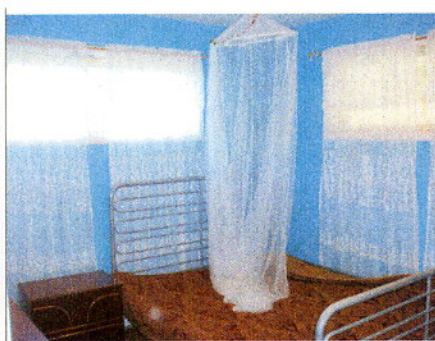
Bed Room #1