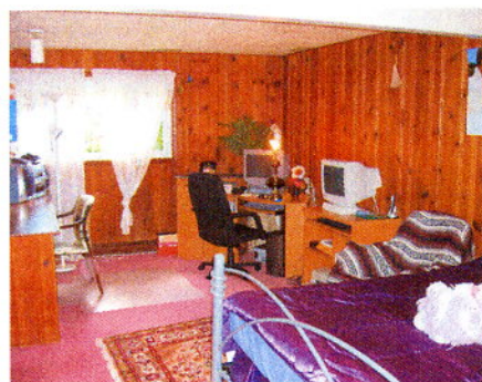
Bed Room #3