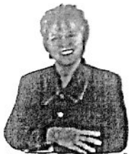
Debbie Dogrul Associates, LLC