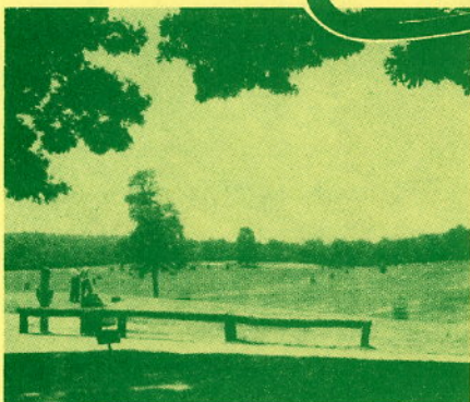
Panoramic View of Adjoining Country Club The facilities of this beautiful club are available to your family for many enjoyable hours.

Adjoining the Fairfax Country Club in Nearby Fairfax County, Virginia