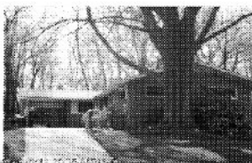
3411 Spring Lake Ter. Sold Price (Jun): $519,000