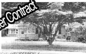
10000 Boxford Ct. List Price (May): $565,000