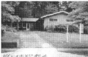
10111 Spring Lake Ter. Sold Price (Jul): $565,000