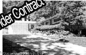
3407 Spring Lake Ter. List Price (Jun): $603,888