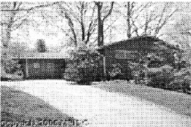
10125 Spring Lake Ter. Sold Price (Jun): $510,000