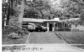
10002 Spring Lake Ter. Sold Price (Aug): $615,000

Thinking of buying or selling a house? Allow Cynthia to be your neighborhood Realtor Expert!