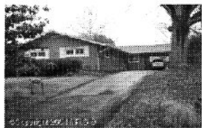
3432 Brookwood Dr. Sold Price (Jan): $476,000