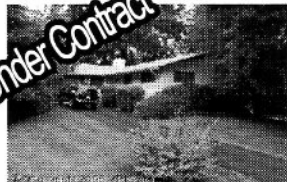
10110 Farmington Dr. List Price (Jun): $535,000