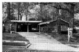
3413 Andover Dr. Sold Price (May): $535,000