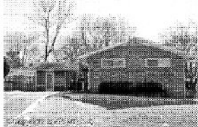
9921 Pinehurst Ave. Sold Price (Apr): $500,000