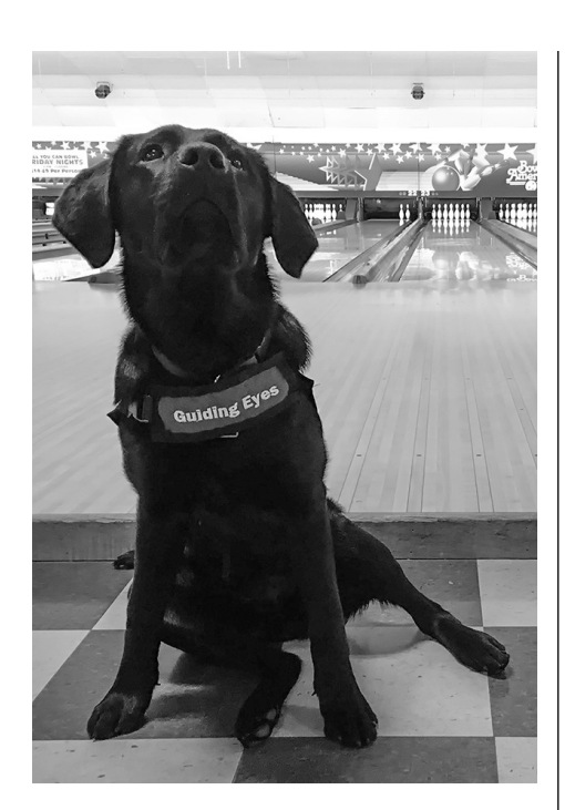
He may not have rolled a 300, but Valor did his best to encourage the humans.