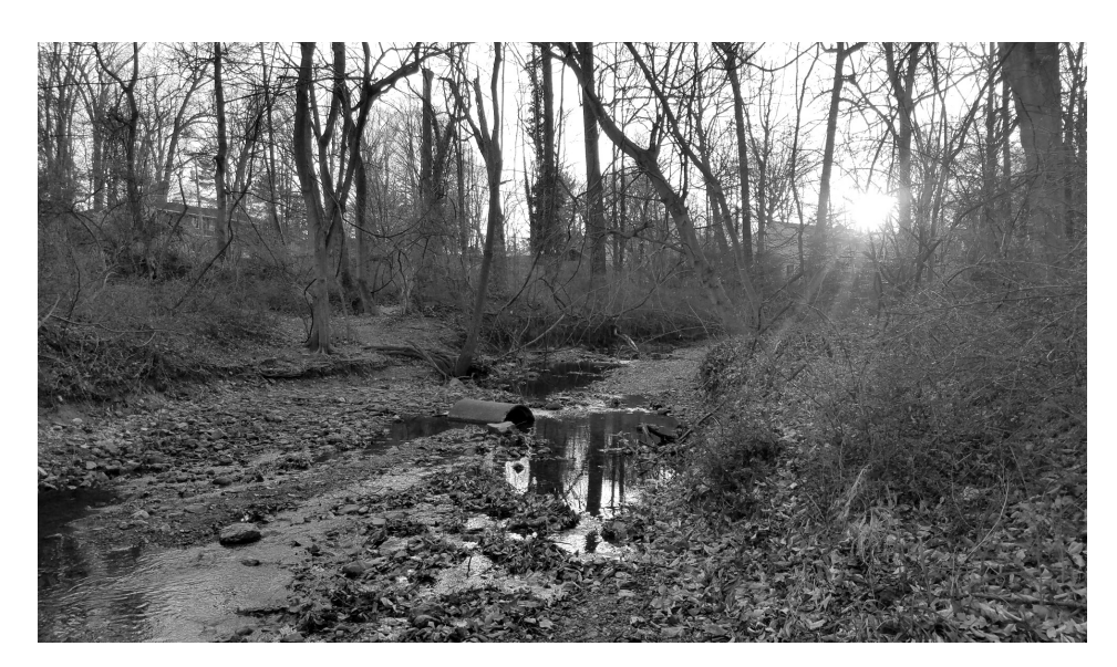
The Accotink Creek at late day.

Help clean up our beautiful Accotink Creek.