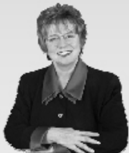
Debbie Dogrul Associates, LLC