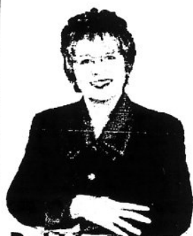
Debbie Dogrul Associates, LLC