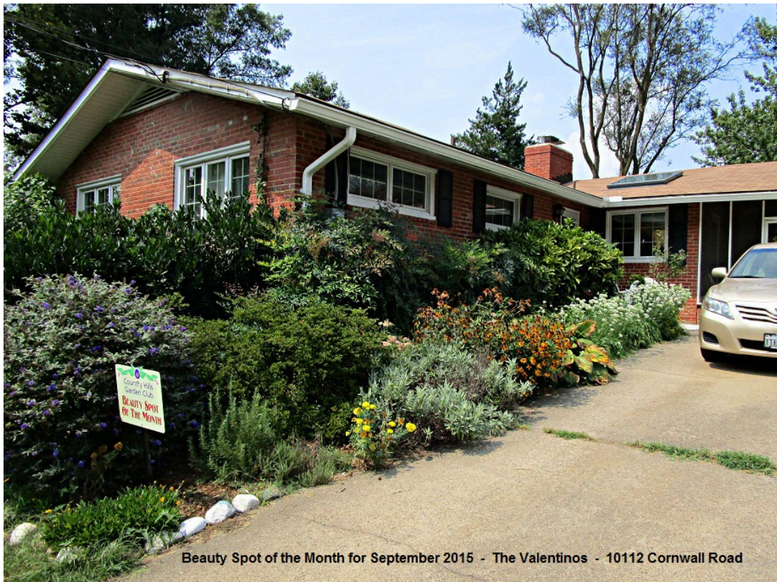
Beauty Spot of the Month for September 2015 - The Valentinos - 10112 Cornwall Road

Stop by and see this beautiful yard— it's chock-full of great design ideas!