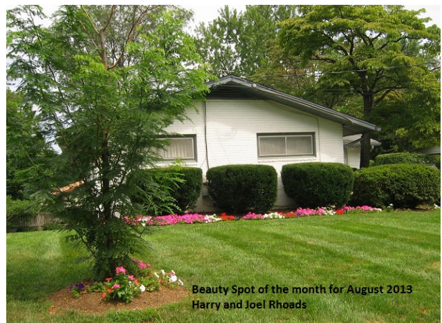
Beauty Spot of the month for August 2013 Harry and Joel Rhoads

Sometimes the Beauty Spot of the Month award goes to a most lavishly landscaped yard—you know, one with lots of fabulous plants, multi-tiered beds, with different sections of the yard set off as garden rooms. This month it's all about simplicity! Congratulations to the Rhoads family of 10106 Cornwall Road. You are the winners of the August Beauty Spot of the Month!