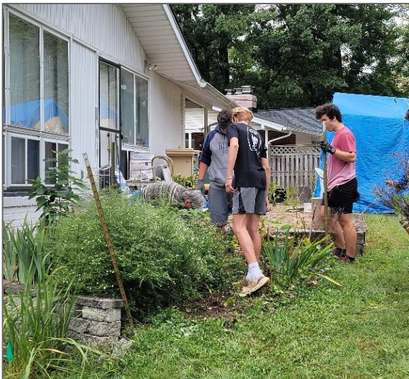
Country Club Hills Civic Association