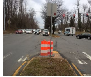
Eaton Place at Rte. 123